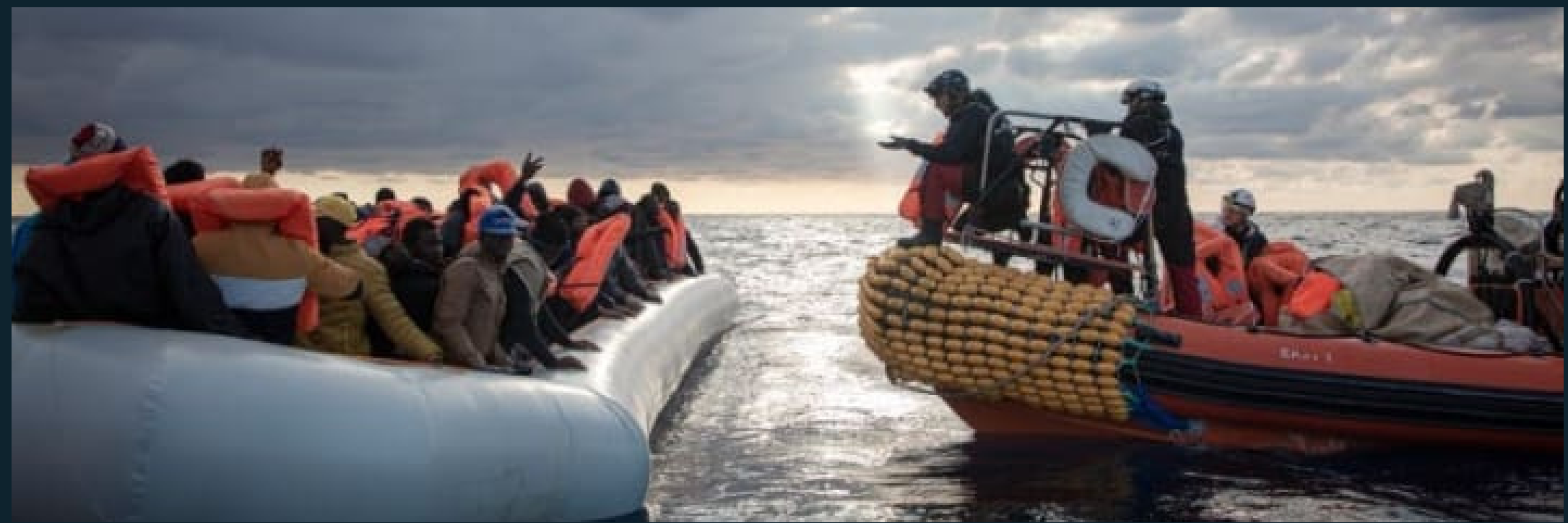
Sources: EY Global; Vatican Migrants & Refugees; Impakter; Norwegian Refugee Council