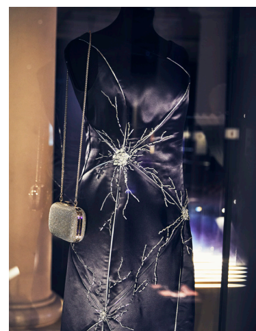
May-Britt Moser's dress. She received the 2014 Nobel Prize in Physiology or Medicine.